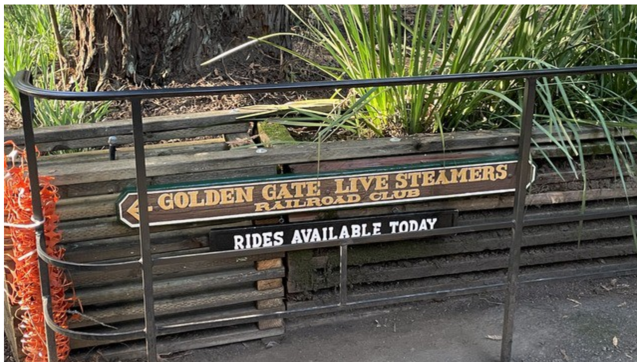
A new sign at our neighbor Redwood Valley Railway, directing riders to our Public Train entrance