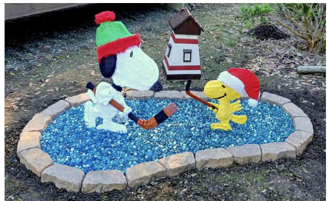
Snoopy and Woodstock get in an ice hockey game among the other festivities