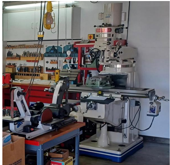
Birmingham BPS-1649 Mill & Tooling