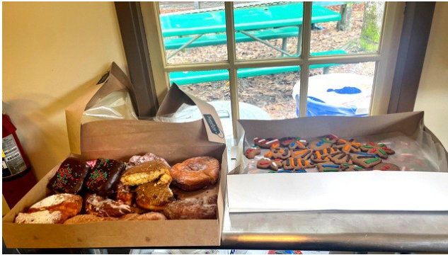
Bruce Anderson sent in the following captioned photos: