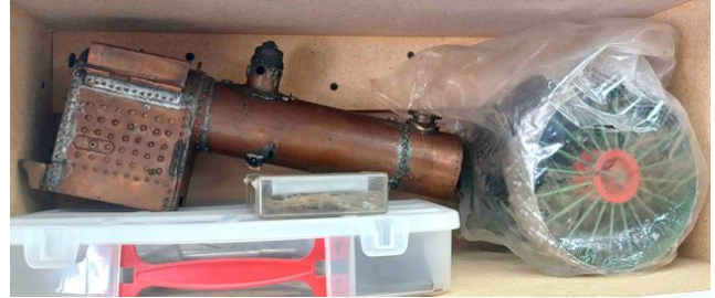
Case Traction Engine

He also has some projects under construction including: