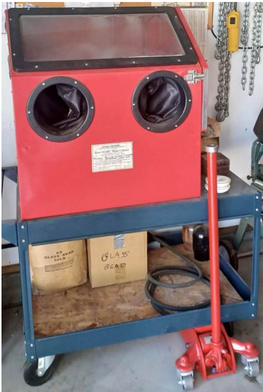
Central Pneumatic Bead Blaster #42202

I think I saw four different drill presses, both gas & electric welding equipment, multiple filled tool boxes, etc. His collection is extensive and access to his Danville shop is relatively straight forward.