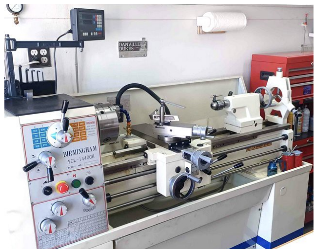
Birmingham YCL-1440GH Lathe & Tooling