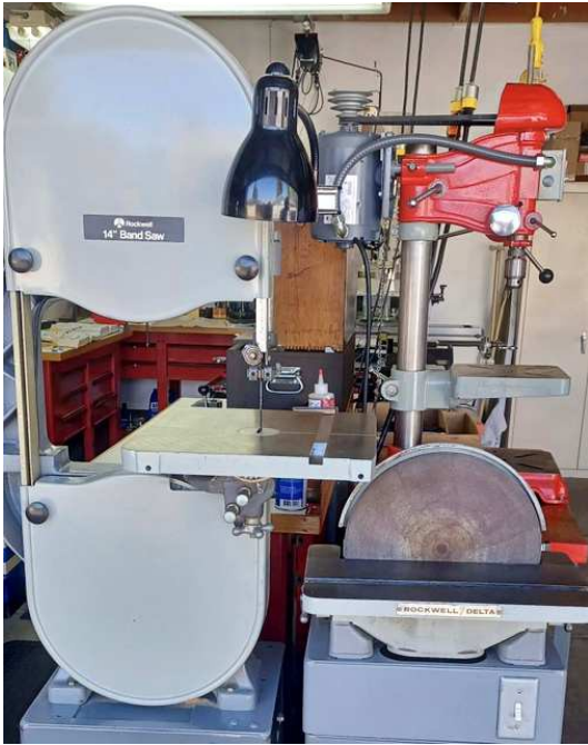
Rockwell 14" Band Saw Apex 16" Disk Sander